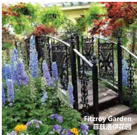
Fitzroy Garden 菲兹洛伊花园